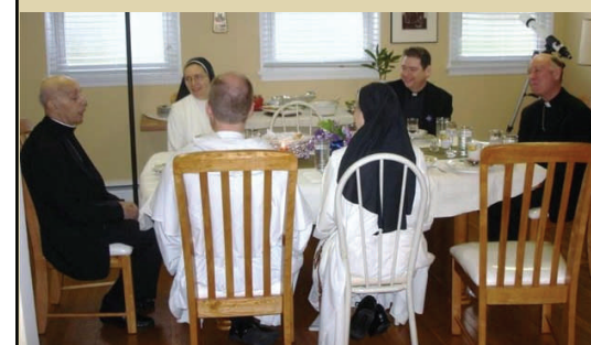
ENJOYING A MEAL WITH THE SISTERS